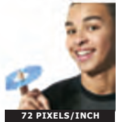
Photo Quality Black and White

If you choose this option, you may want to have the whole label area covered in white. This will create a true photographic image. However, a simple black or blue design on the mirrored surface can look dramatic as well.